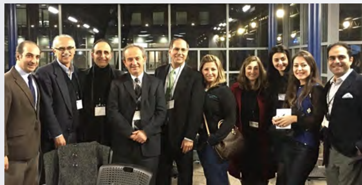
Mentoring 2018, Group of AAHPO professionals present at Fordham

Webinars: AAHPO is always on the look out for the latest technologies to facilitate remote communication with students, peers and the public.