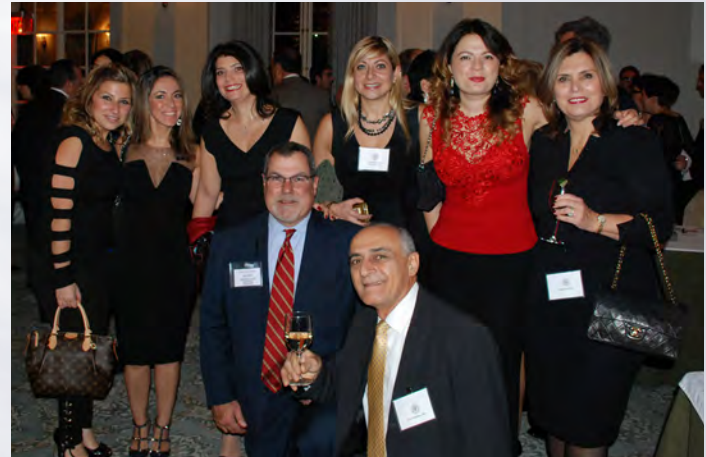
Joint dinner AAHPO with Armenian Bar Association (above) and Armenian Engineers and Scientists (below)

In June 2011, Armenian American Health Professionals Organization, AAHPO, was recognized for its Educational efforts to improve health awareness, disease prevention, and early disease detection for Armenians and others, both locally and in Armenia and was selected as a finalist in the Education