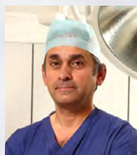
Dr. Ara Darzi