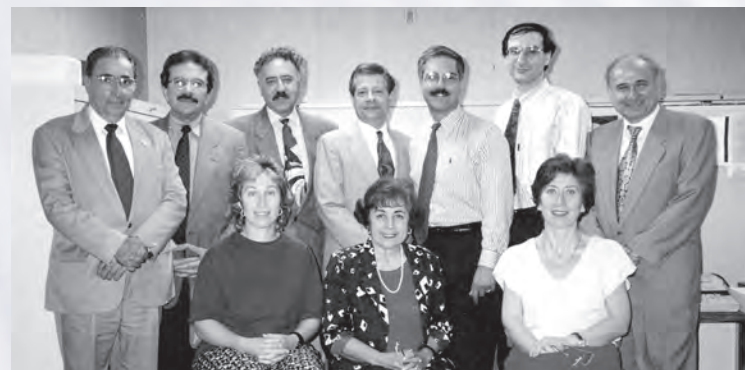
1995-1996 Executive Officers.

Throughout the past 25 years, AAHPO's presidents and board members implemented and expanded AAHPO's mission assisted by an increased membership in the organization, commitment and dedication of its members and engagement of the community. Rejuvenated by novel ideas and energy, AAHPO's mission shifted to a higher level of service with the development of new and innovative programs geared to serving the tri-state local Armenian communities as well as Armenia.