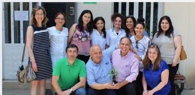
July 2019 Medical Mission to Armenia participants