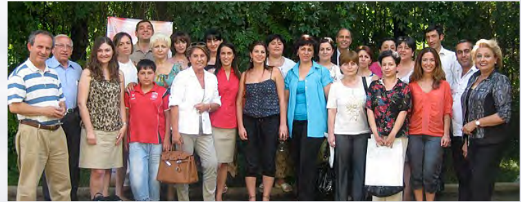
Some CME program graduates with AAHPO Medical Mission participants during the July 2011 Medical Mission to Armenia

Since 2010, AAHPO's steadfast commitment to the Continuing Medical Education Program resulted in the training of 25 physicians each year. More than 200 health care providers have benefited from this program so far, with many more waiting to participate in this invaluable opportunity.